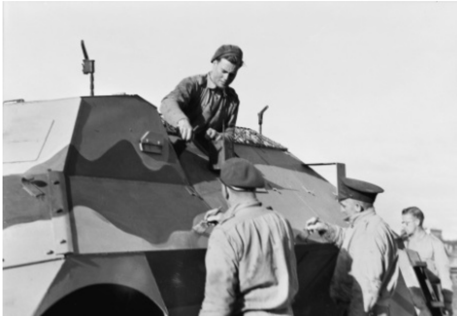
1943-06-02. PERSONNEL OF M.T. VEHICLE PARK, GROUP 1A, RECAMOUFLAGING ON ARMoured CAR.