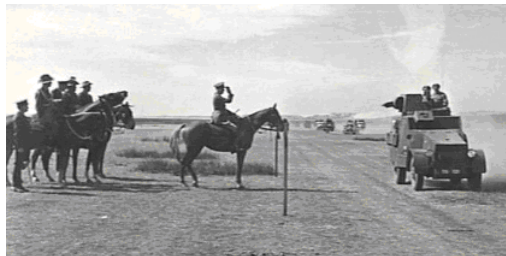
1940-04-07. ARMoured CARS PASS HIS EXCELLENCY THE GOVERNOR GENERAL