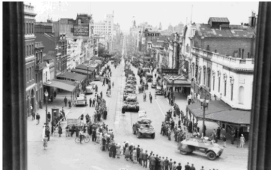
Parade of Australian Military vehicle, Melbourne, Victoria, 11/11/1942

Vehicle bottom right is a Rover Armoured Car followed by a Rhino Heavy Armoured Car, then Sentinel tanks.