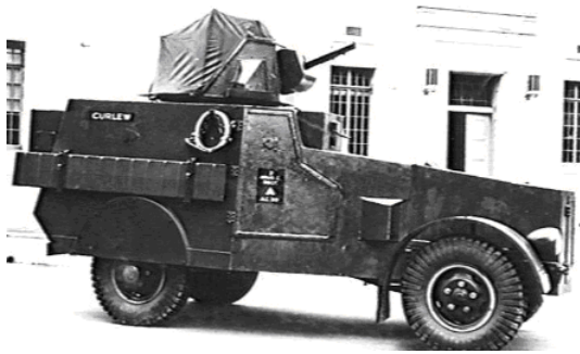
LP3 - "CURLEW"

All Ford LPs were all out of service during 1942.